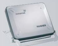
HNS 9201 by Hughes